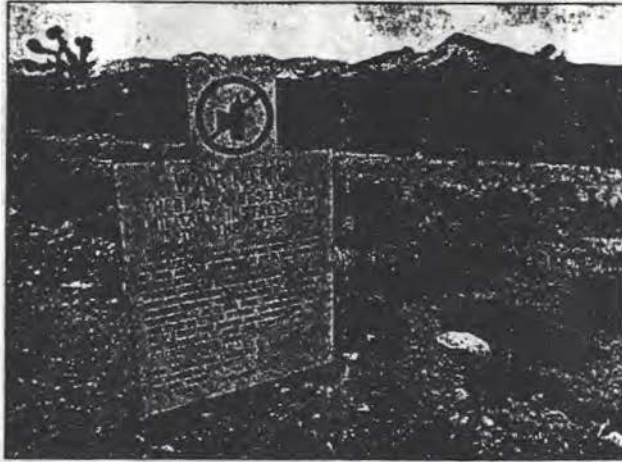
ANOTHER SIGN This is one of many warnings in the south-central Nevada desert aimed at keeping the curious away from Groom Lake.